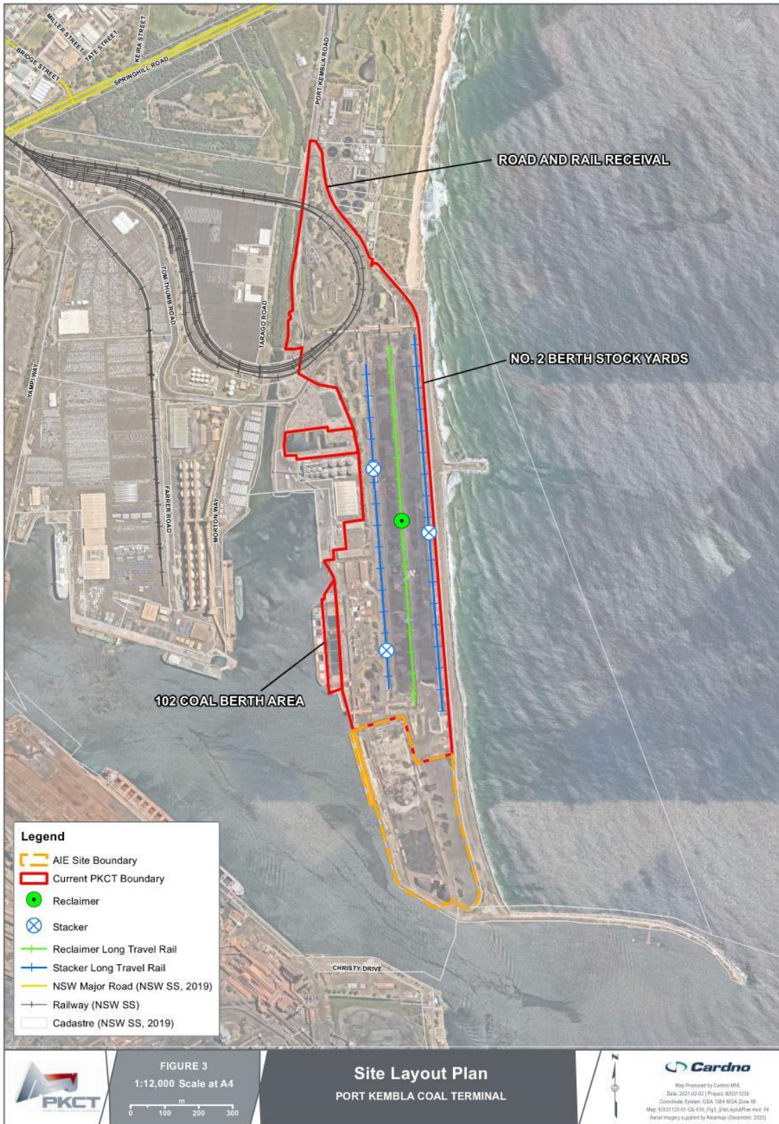
Figure 3: PKCT Site Layout