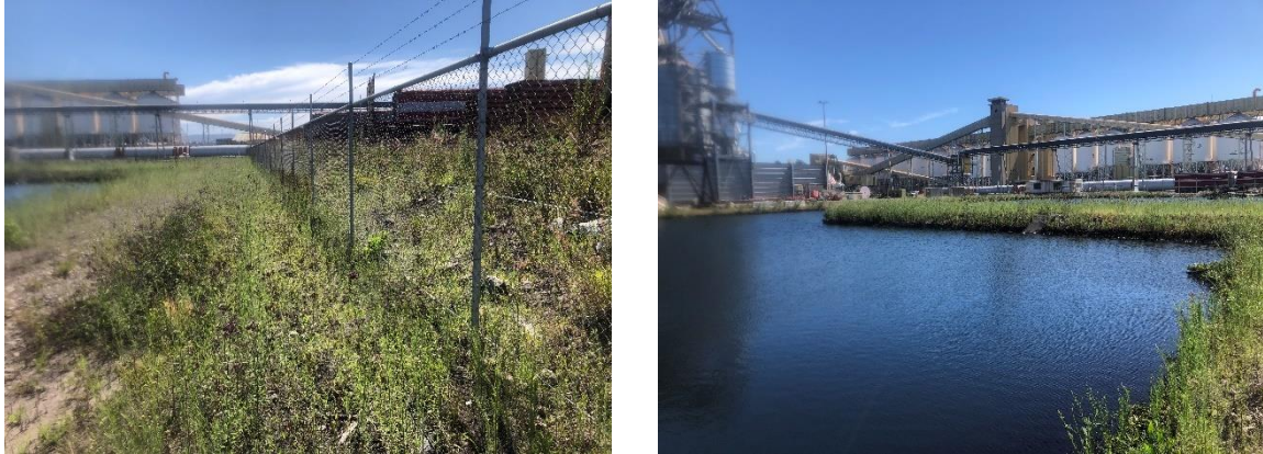
Figure 4: PKCT Lagoon