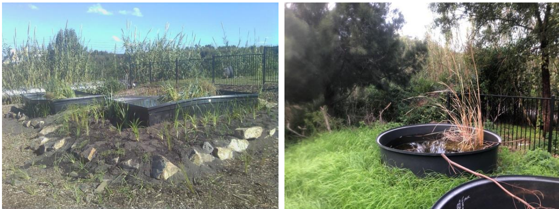
Figure 1: GGBF Ponds – April 2010 (left) and July 2020 (right)

In accordance with BEC’s recommendations, Greenhouse Park GGBF habitat was constructed in consultation with BEC, the site was moved south to a location acceptable to Wollongong City Council (WCC). The Project was undertaken by PKCT and WCC (land owner) and was completed in April 2010 as shown in Figure 1 below.