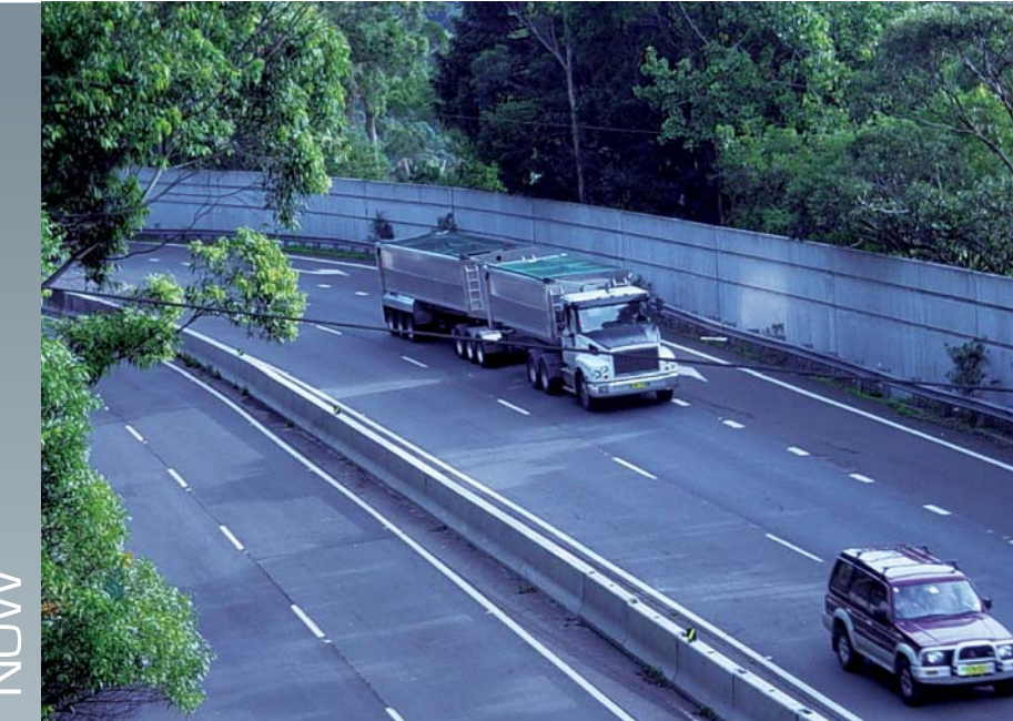
Coal trucks represent a small percentage of total traffic on Mount Ousley and Springhill Roads, at 1-2%