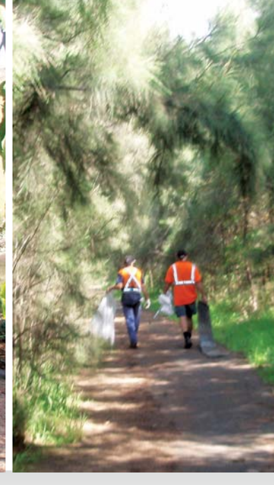
The Coal Terminal is pleased to be a part of this worthwhile clean up activity, with employees volunteering to support by picking up rubbish

The Port Kembla Coal Terminal supported the Friends of the Tom Thumb Lagoon and Conservation Volunteers Australia by both sponsoring and practically participating in the Business Clean-up Australia Day in February 2008 at the Tom Thumb Lagoon Wetland.