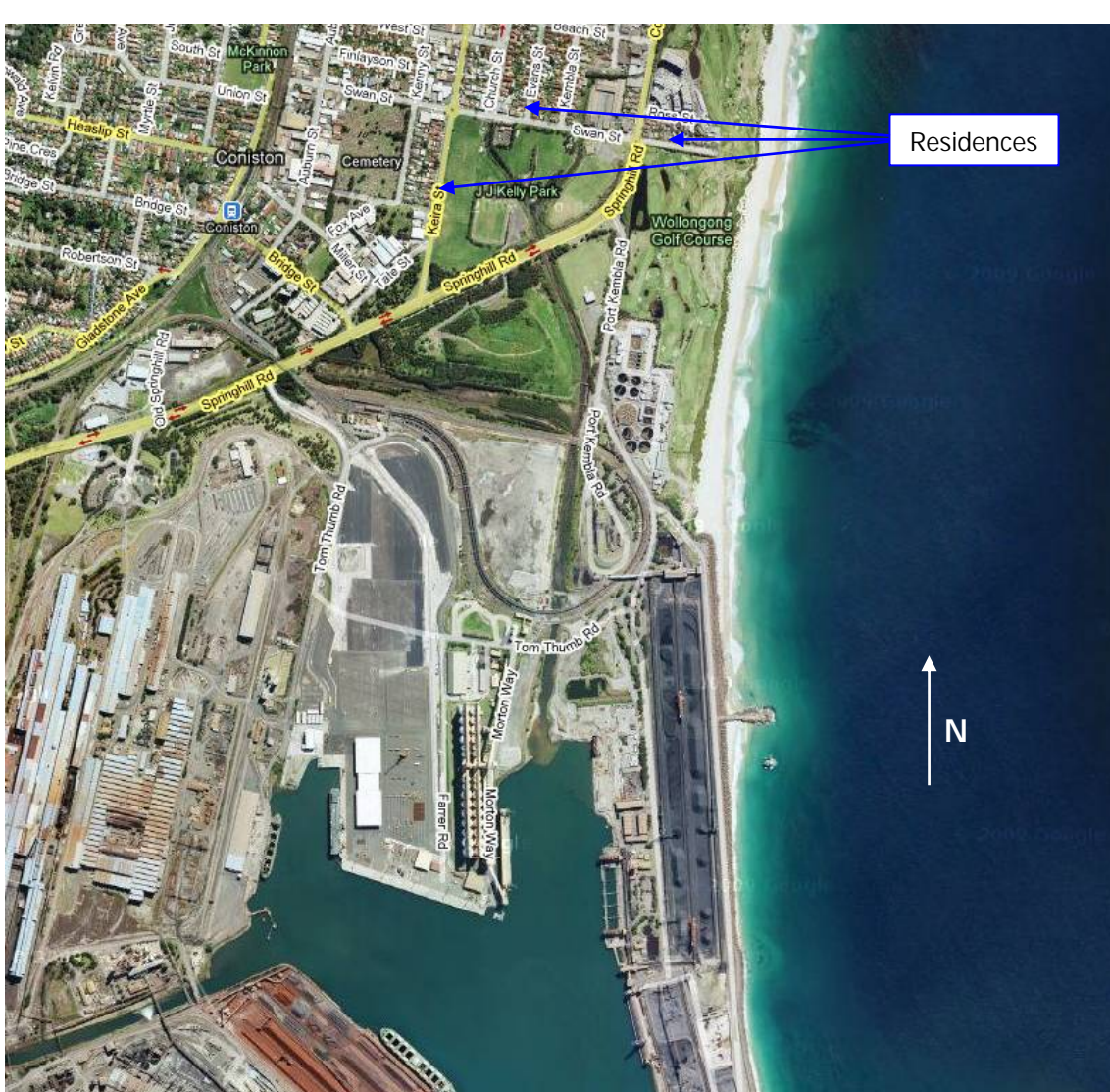
Figure 2-2 PKCT and Surrounding Receivers