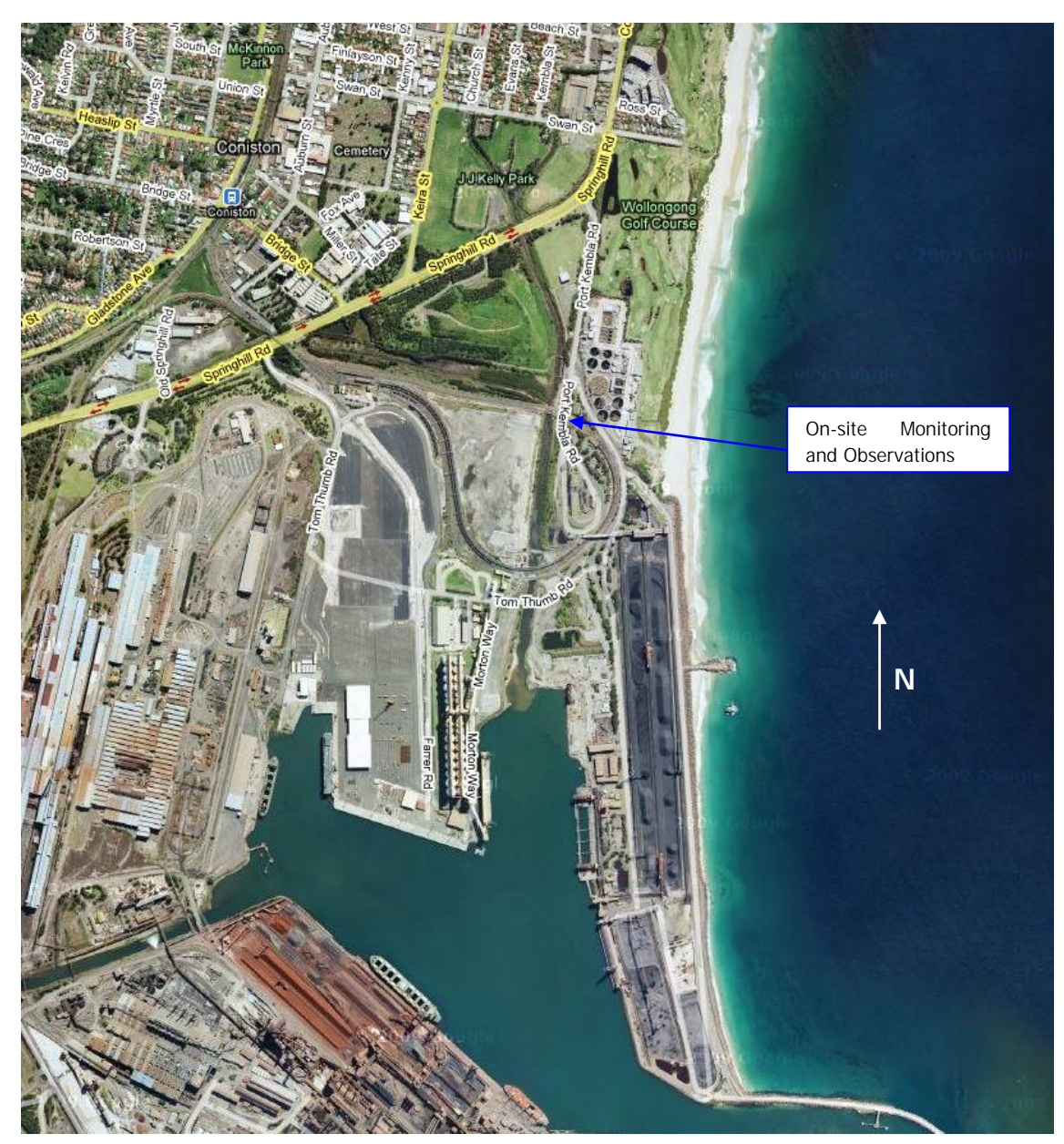
Figure 4-4 Monitoring Location – Receivals