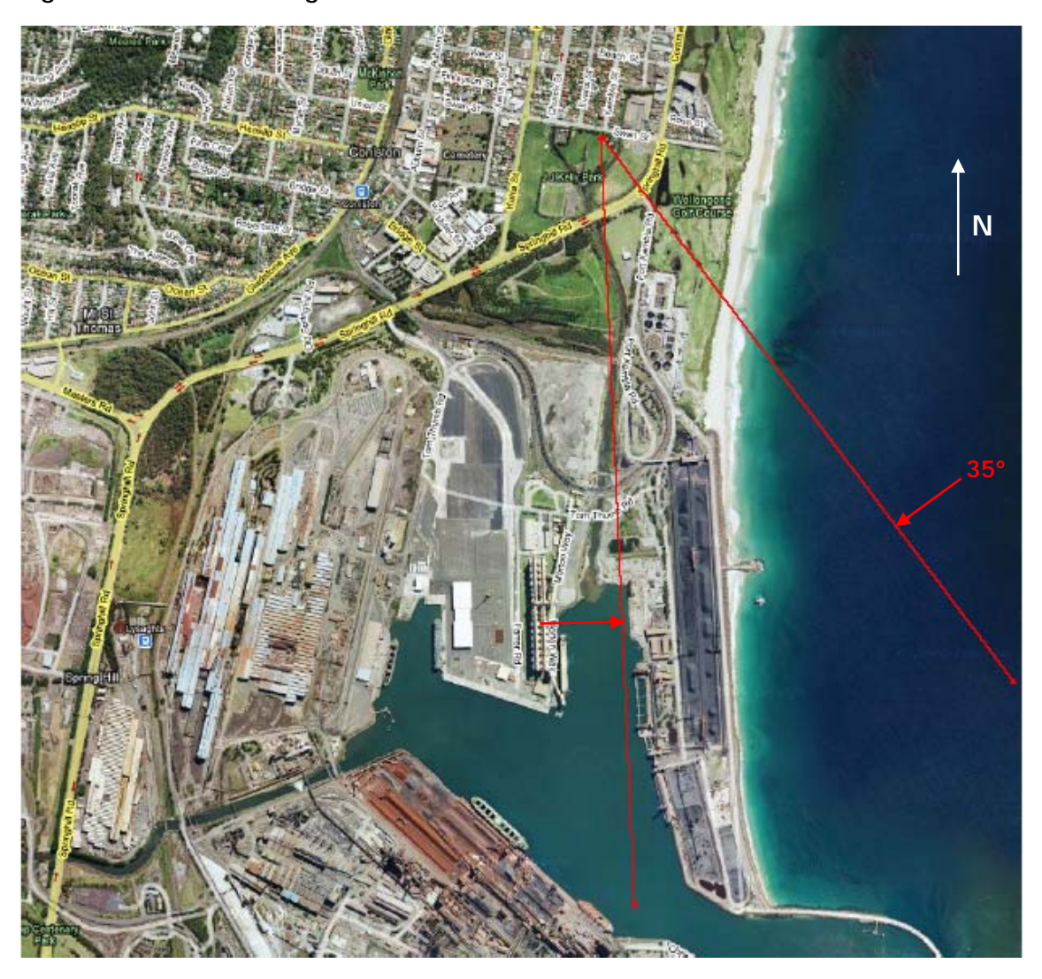
Figure 4-1 Monitoring Location 1 – Corner Swan & Kembla Streets

Figure 4-1 to Figure 4-3 show the monitoring locations and the relative angular exposure to the PKCT operations. Figure 4-4 shows the approximate locations where observations and measurements where taken in the vicinity of the receival area.