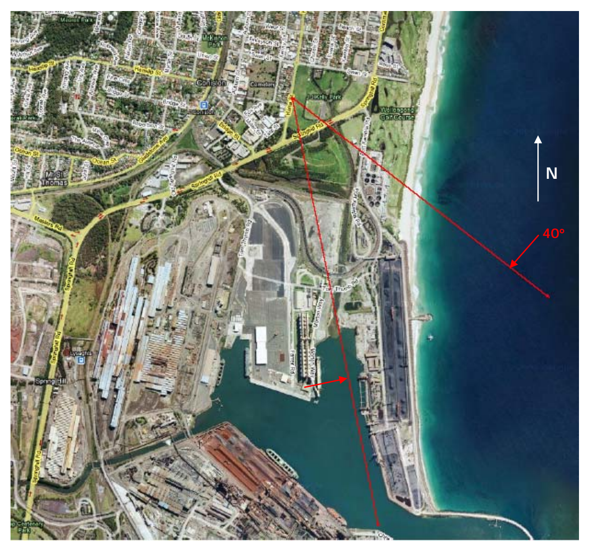
Figure 4-3 Monitoring Location 3 – Corner Keira & Fox Streets